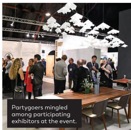
Partygoers mingled among participating exhibitors at the event.