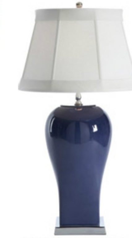
Chelsea House lavishes a deep, vibrant shade of blue on ceramic in the classically styled, Italianmade lamp, finished with crisp linen shade.