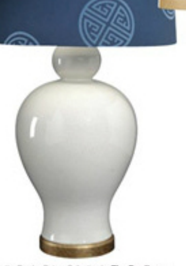
From the Barclay Butera Collection by The Bradburn Company, the Pacific Realm lamp pairs glazed porcelain with gold trim and finial. The two-toned blue silk shade is a Butera fabric from Kravet ($009).

Bold and brilliant shades of blue light up the latest lamp designs. The season's hottest colors - indigo, peacock, turguoise - lend on-trend, vivid elegance to classical styles. - TRACY BALLA