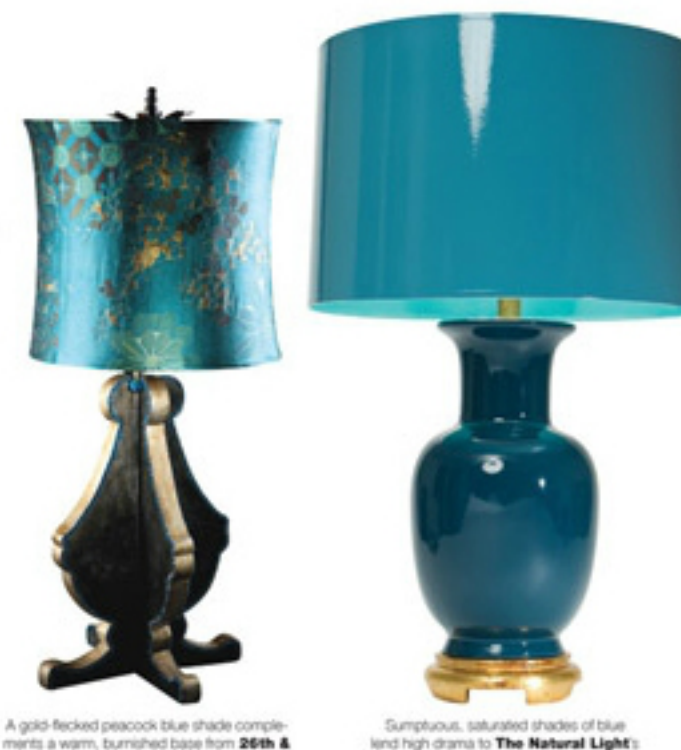
lend high drama to The Natural Light's polished design.