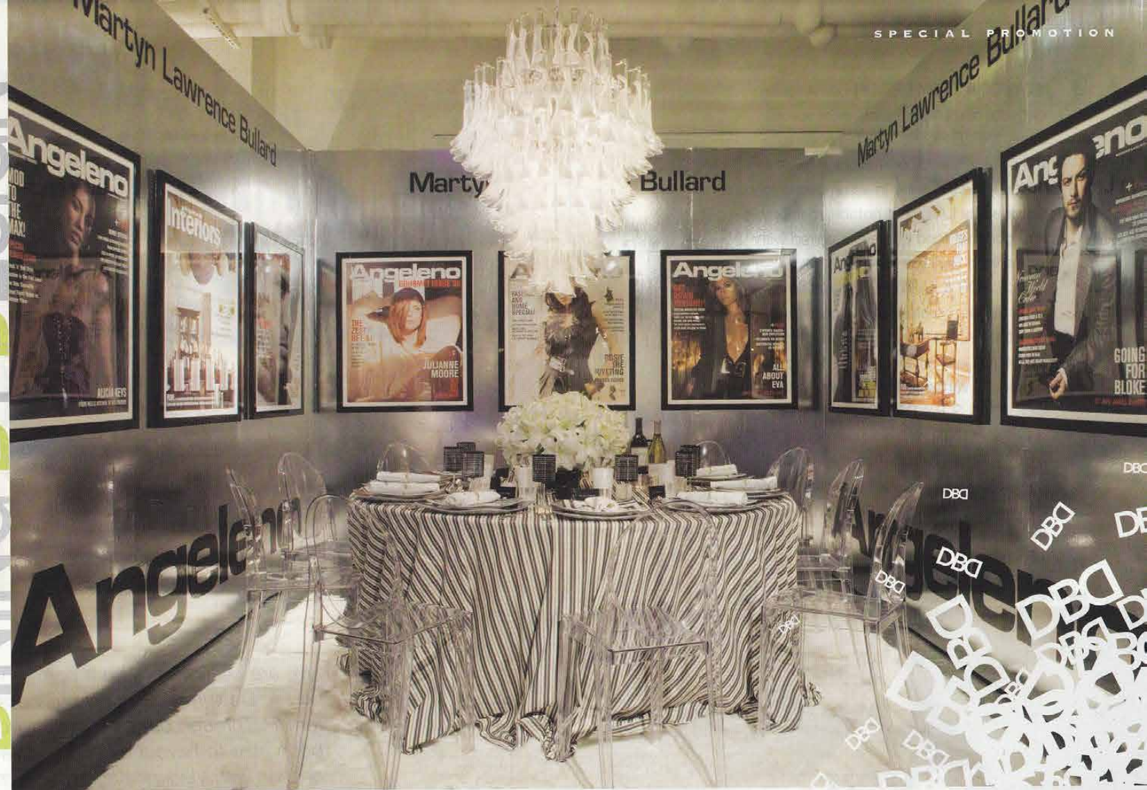
ANGELENO MAGAZINE, DESIGNED BY MARTYN LAWRENCE BULLARD