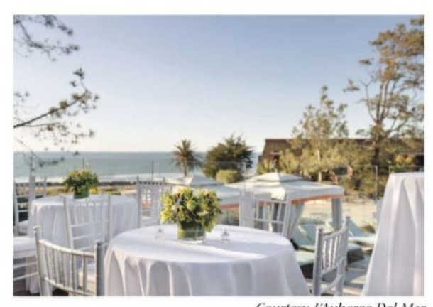
Meeting groups can hold events on the Ocean Terrace at L'Auberge Del Mar near San Diego.