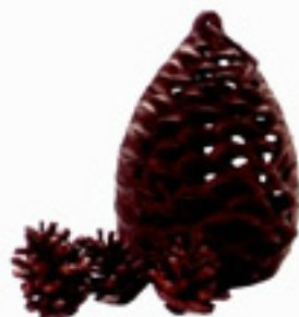
Display organic accessories. Ceramic vase, $89, and iron pinecones, $11-$32, from Ward & Child—The Garden Store , SLC