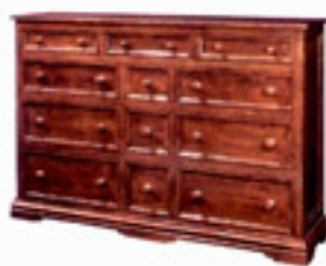
Choose simply styled chests and consoles in warm wood finishes. See Air Twelve Drawer Chest, $5,960, from Barclay Butera , Park City

FALL 2008 $4.95 U.S. 0 74470 91829 1 DISPLAY UNTIL DEC. 31 UTRASTYLEANDDESIGN