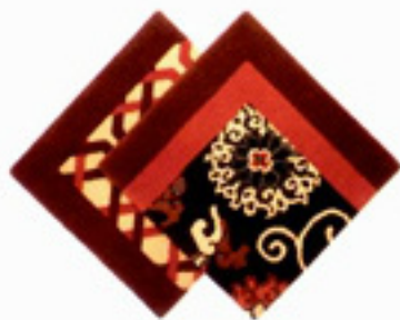
For an updated, contemporary version of a traditional Oriental rug, choose colorful, more graphic custom rugs.