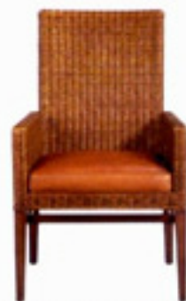
Mix wicker, leather and fabrics in your furniture materials palette. Wicker host armchair, $549, from Ethan Allen , Sandy