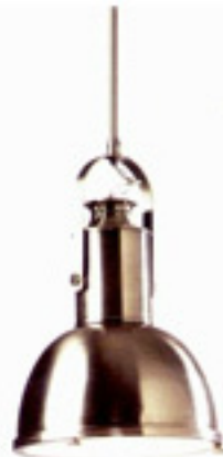
Replace small, outdated pendants with large industrial fixtures. Retro Photographers Pendant, $179, from Ethan Allen , Sandy