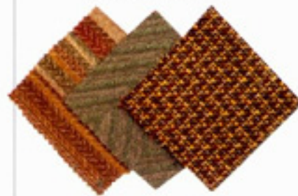
Layer linear patterns, plaids and organic florals in natural colors on upholstered pieces and bedding.