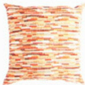
Use patterned, mismatching pillows to animate plain fabric-covered sofas and chairs indoors and out. Kieran orange pillow, $79, from San Francisco Design , SLC