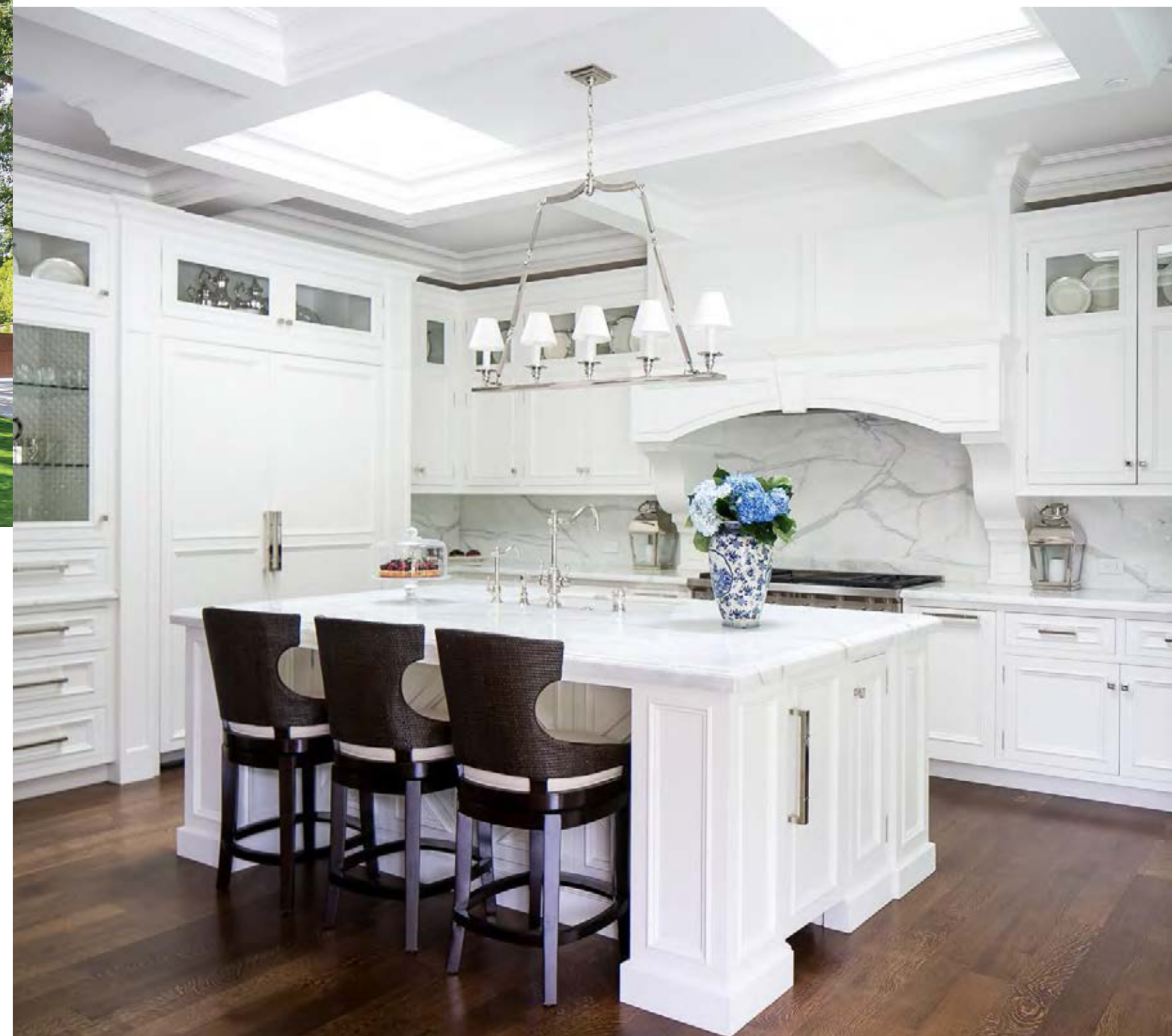
OPPOSITE Butera loves a crisp white kitchen but placed chocolate croc leather barstools to warm the space.