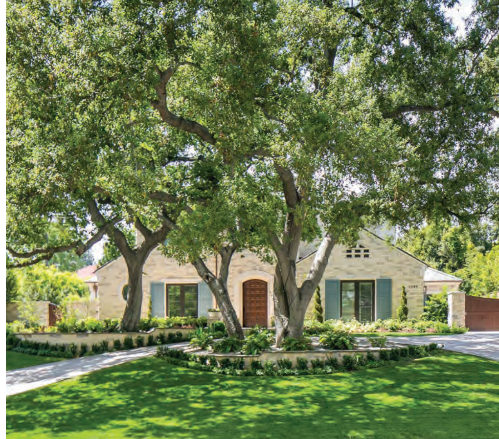
ABOVE This Pasadena house has traditional architecture to correspond with the neighborhood.