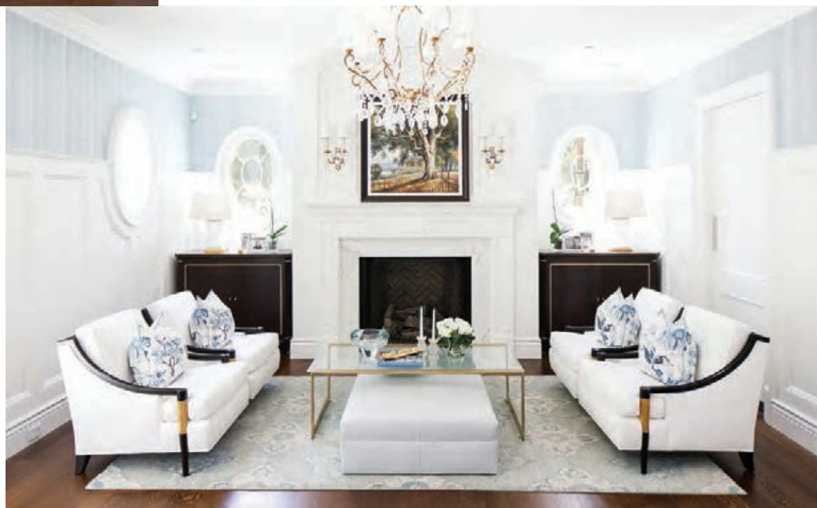
RIGHT A great conversational space is created by having matching sofas face each other with a fireplace that is perfect for cool evenings.

"Our goal was to marry form and function here, all the while keeping it very glamorous. I think the success of any project has to be the overall final result and happy clients make us the most proud."