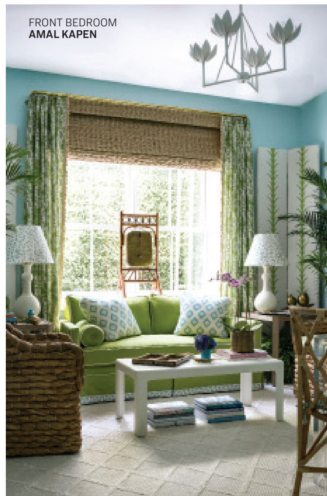
FRONT BEDROOM AMAL KAPEN