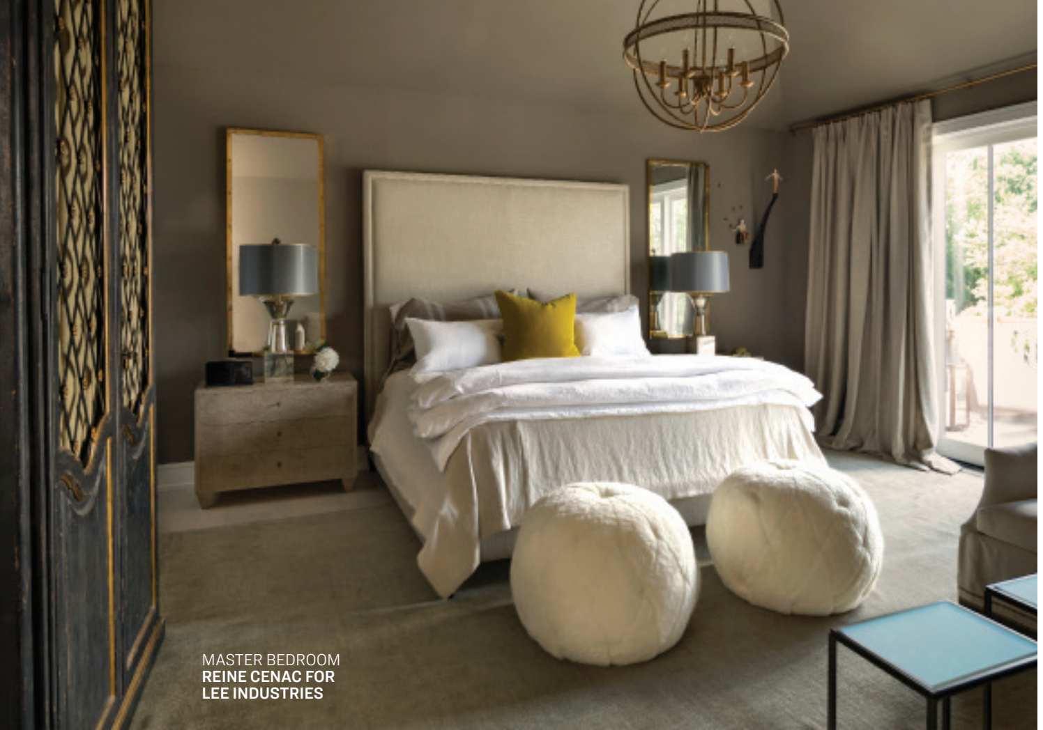
MASTER BEDROOM REINE GENAC FOR LEE INDUSTRIES