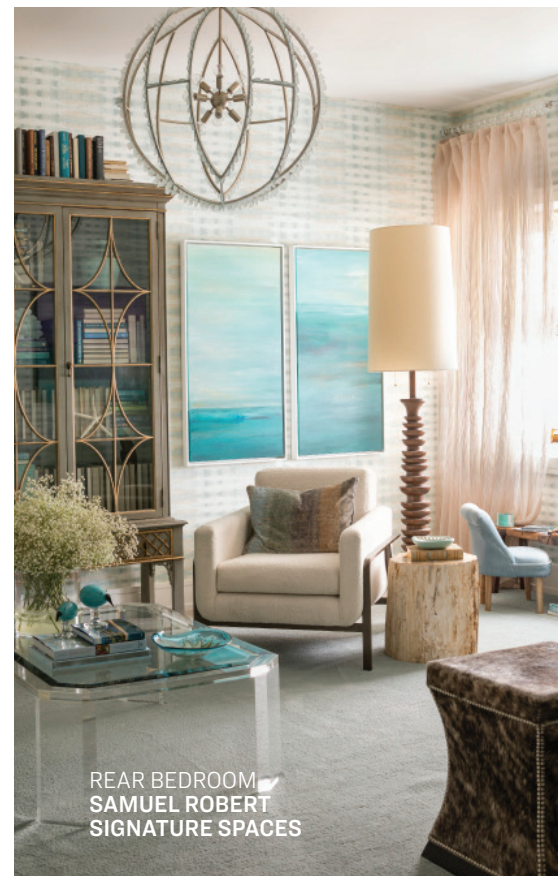
REAR BEDROOM SAMUEL ROBERT SIGNATURE SPACES

For more information, see sources on page 110