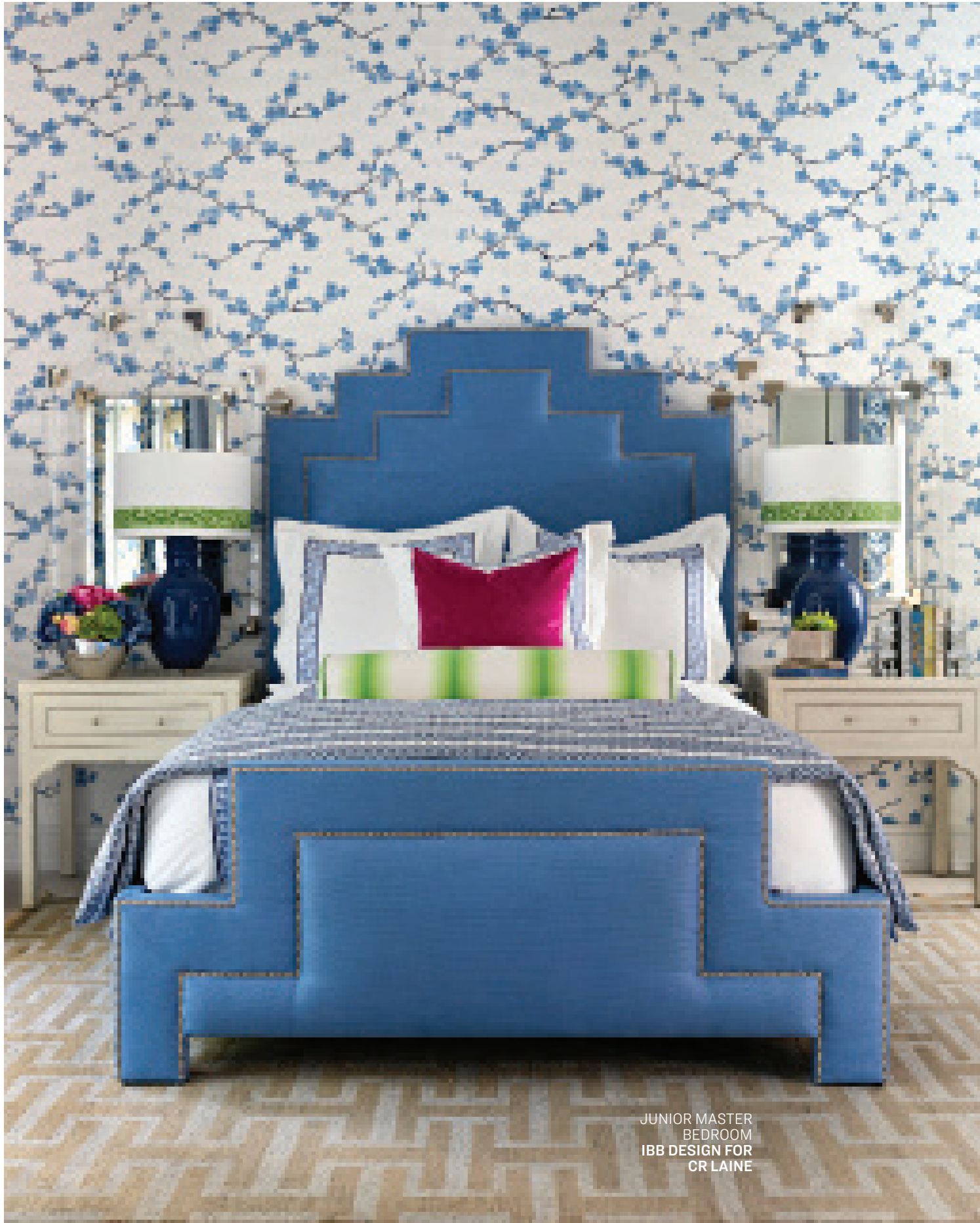
JUNIOR MASTER BEDROOM IBB DESIGN FOR CR LAINE