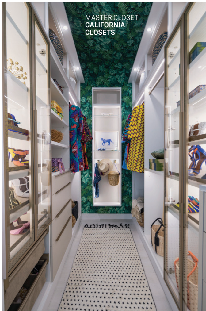
MASTER CLOSET CALIFORNIA CLOSETS