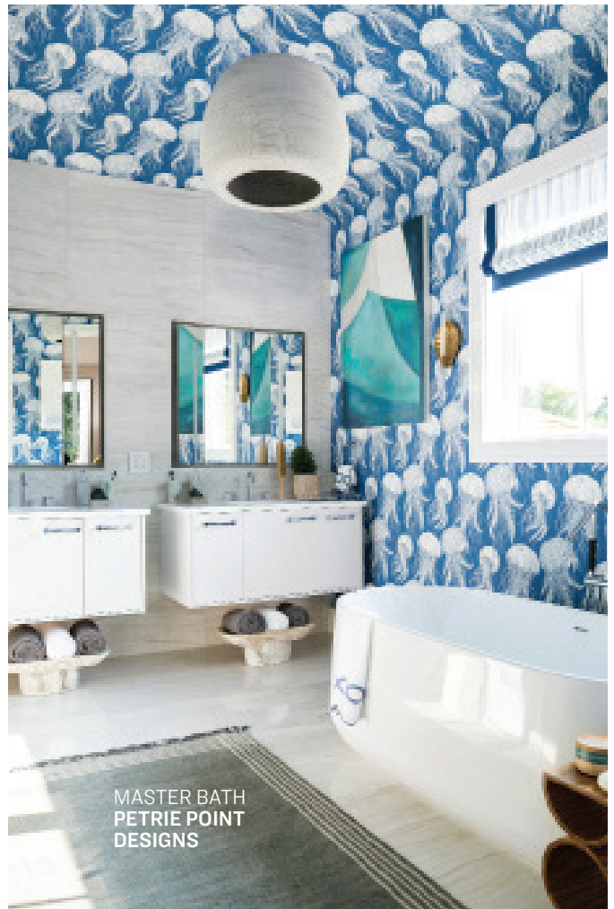
MASTER BATH PETRIE POINT DESIGNS