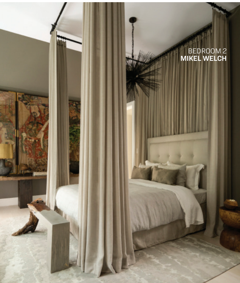
BEDROOM 2 MIKEL WELCH