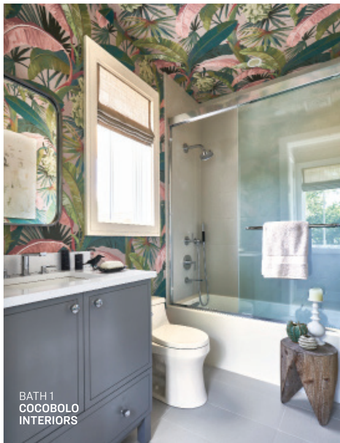
BATH 1 COCOBOLO INTERIORS