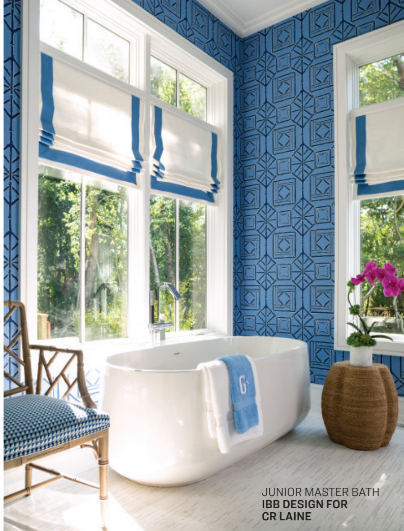
JUNIOR MASTER BATH IBB DESIGN FOR CR LAINE