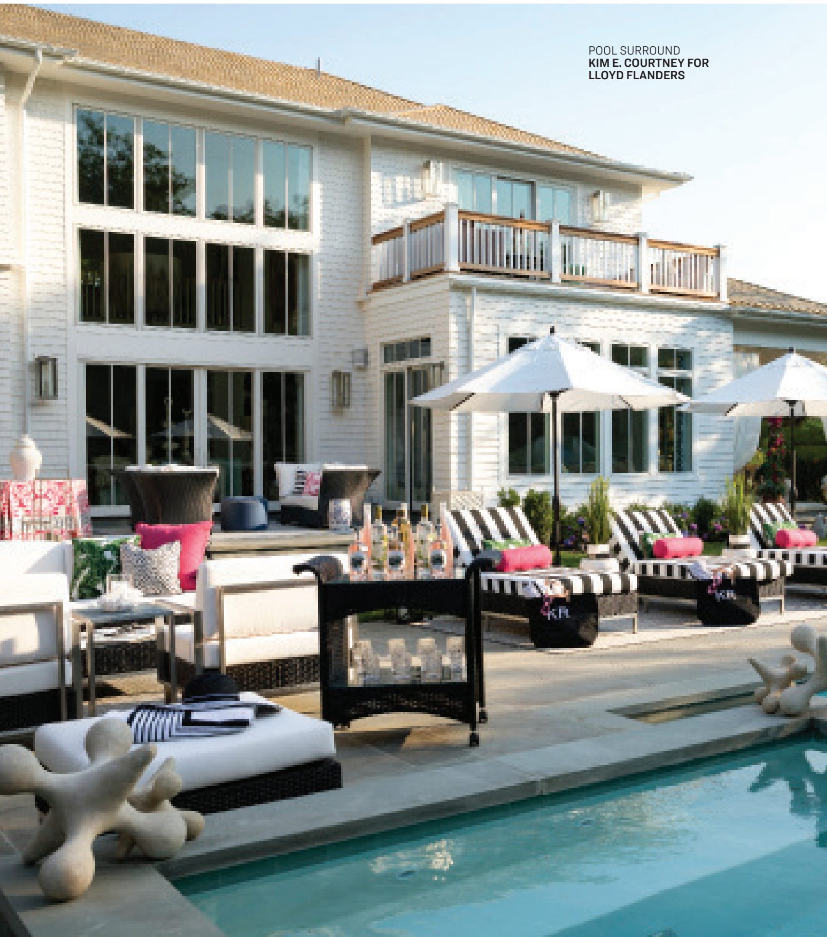
POOL SURROUND KIM E. COURTNEY FOR LLOYD FLANDERS