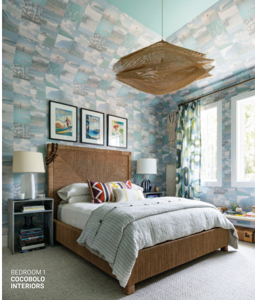
BEDROOM 1 COCOBOLO INTERIORS

Bath 1 The designers from Cocobolo Interiors wanted to have a bit of fun with the guest bath. A coral-hue wallcovering in a palm frond motif climbs the walls and covers the ceiling. The happy sanctuary is outfitted with a Kohler showerhead, hand shower, toilet, sink faucet, and “Mohair” gray vanity. The “Iconic White” countertop is from Silestone by Cosentino.