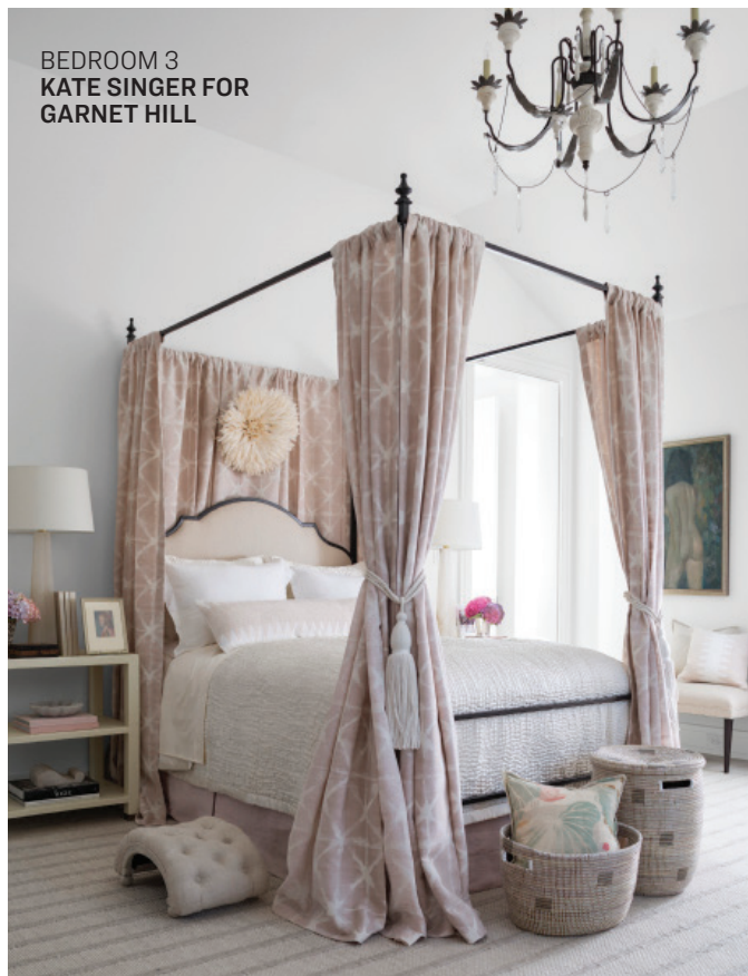
BEDROOM 3 KATE SINGER FOR GARNET HILL

Bedroom 2 “I like my spaces to feel timeless,” Mikel Welch says. “The best way to do that is by picking a palette that is constant: the Earth.” He did just that in decorating this guest bedroom. Wood accents join a trio of 18th-century Chinese paintings. A lamp with an antique-brass shade and a Sputnik-style chandelier are from Circa Lighting. The bed linens, comforter, and pillow shams are by Garnet Hill. A custom drapery-paneled bed steals the spotlight. The sculptural bench at its foot is formed from driftwood and concrete.