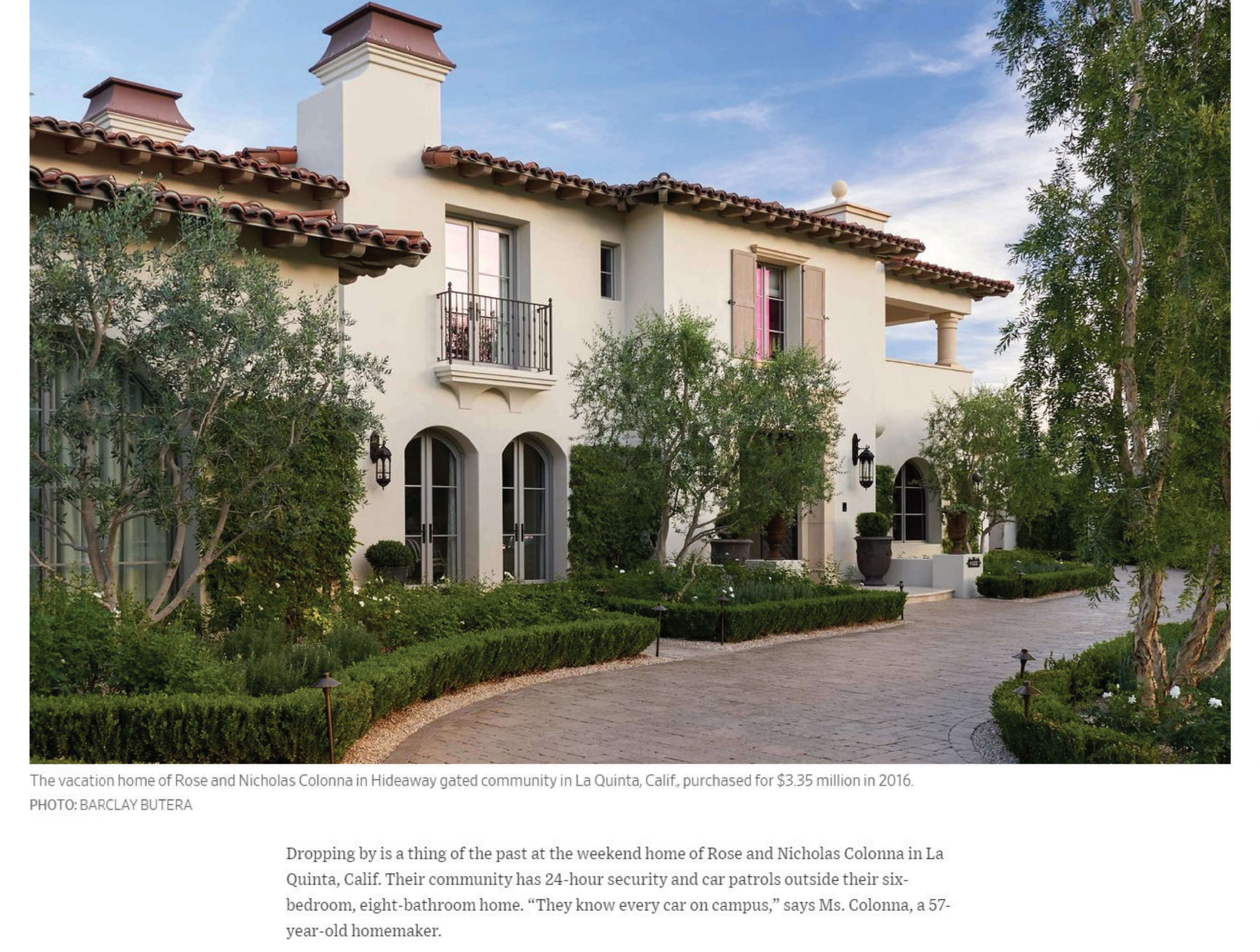
They pay $600 in monthly fees, including security. In Ms. Colonna's home, the outdoor pool and fire pit allow the family, with three adult

seating space adorned with crystal chandeliers.