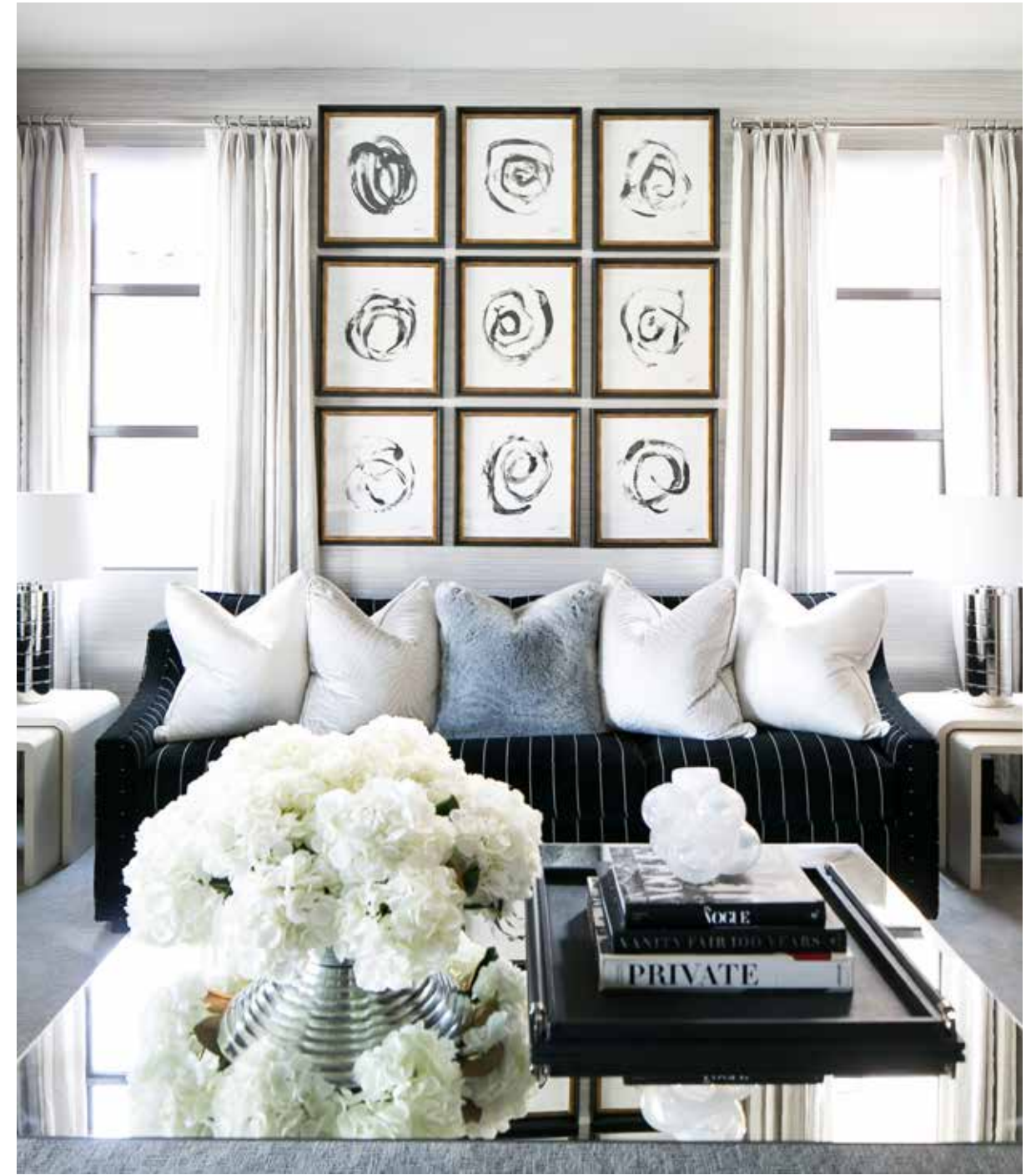
PRIMARY BEDROOM: Den-like sitting area. Sofa is outfitted in a chic Ralph Lauren Home pinstripe.